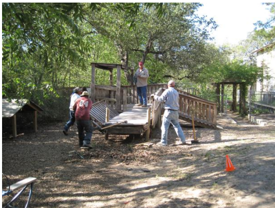
(workers tearing down the old fort last month)

Many thanks to parents, Board members, and teachers for helping us raise funds to rebuild the fort. Children love to climb! Children NEED to climb! We need your gifts to collect all that is needed to build a wonderful and safe new climbing structure. Please send in your tax-deductible gift today. On behalf of the children....Thank You!