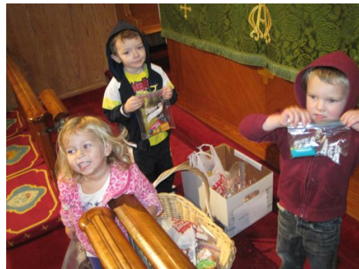
Children were happy to give their Halloween Candy Tithe!