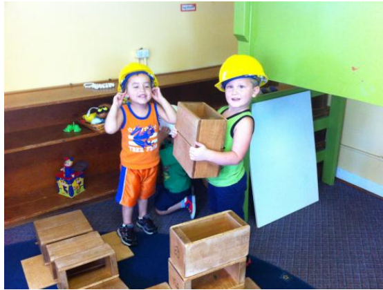
Pre K loves blocks!