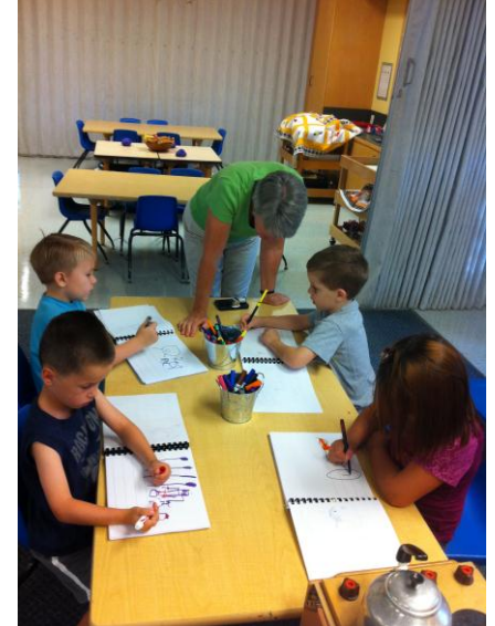
Time for Journal Writing!