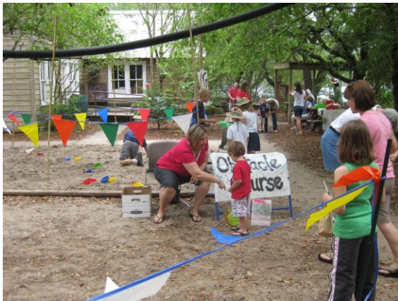
FESTIVAL FUN from 2009

Forgiven and Forgiving , by William Countryman