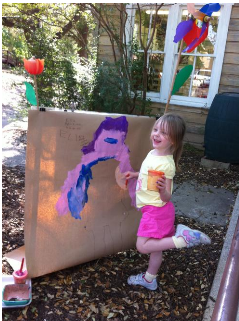
The Pre K children are tracing and painting their body shapes! PAINTING....

Be sure to check the St. Thomas Episcopal Church Website for the HOLY WEEK schedule.